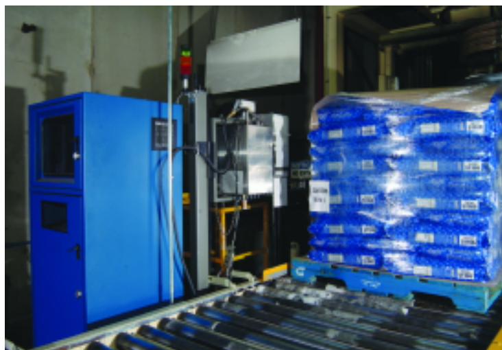
A PC is in place on the labelling system as plans are in the works to further integrate the system with the plant's warehouse management system (WMS).

installation of a 3138-N Dual Action Tamp Printer labeling machine manufactured by Fullerton, Ca.-based Label-Aire Inc. , the labeling machinery arm of industrial equipment group Impaxx, Inc. of Fullerton, Ca.