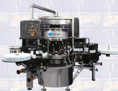
The Rotary Series 9000

Our rotary labelers apply a wide variety of labels to products in a wide variety of industries. You can count on the Label-Aire Rotary Series 9000 to give you more.