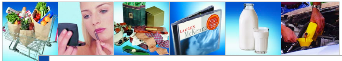
Auto Splice Dual Unwinder With Festoon