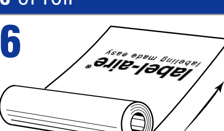
Design printed across roll. Bottom of design leading into machine.