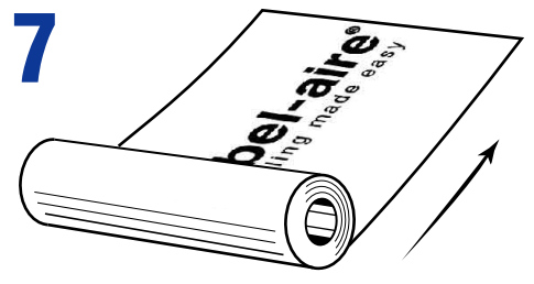
Design printed with the roll. Right-hand side of design leading into machine.

Headquarters 550 Burning Tree Road Fullerton, CA 92833 USA