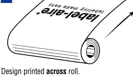
Bottom of design leading into machine.

o 714.441.0700 f 714.526.0300 e info@label-aire.com w www.label-aire.com