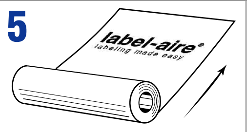
Design printed across roll. Top of design leading into machine.