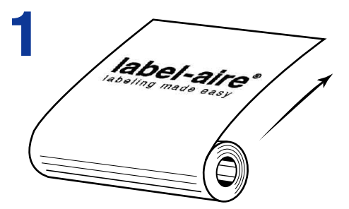
Design printed across roll. Top of design leading into machine.