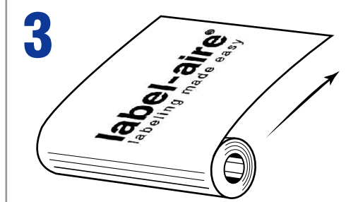
Design printed with the roll. Right-hand side of design leading into machine.